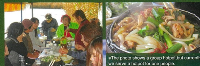
※The photo shows a group hotpot, but currently we serve a hotpot for one person.