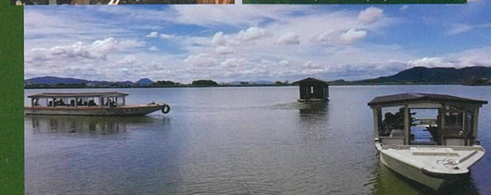
※The set plan is the price for one person when 5 people use it. ※Charter Taxis are for 9 people. ※The price may be revised.